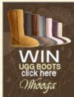
Whooga Ugg Boots